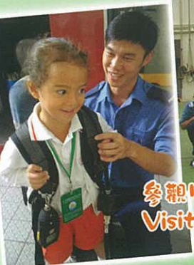
參觀中區消防局 Visit The Central Fire Station