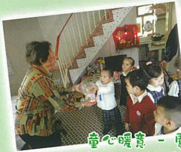
童心暖意 - 關愛耨居長者行動 Love From Children