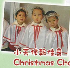
小天使報佳音 Christmas Chorus