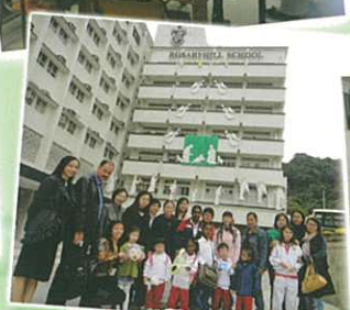
參觀小學 Visit Primary School