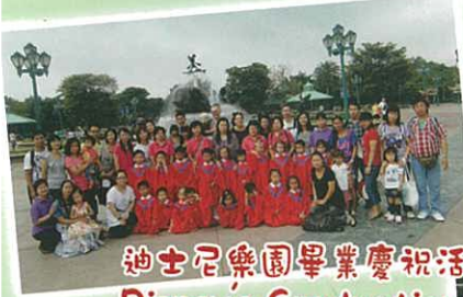
迪士尼樂園畢業慶祝活動 Disney's Graduation Ceremony