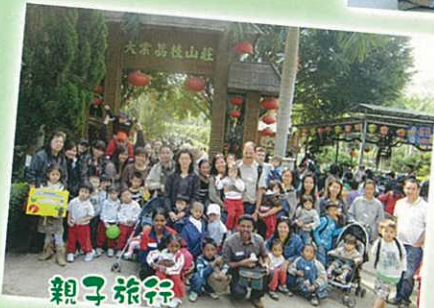
親子旅行 Parents - child School Picnic