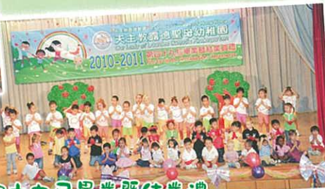
第四十九屆畢業暨結業禮 49th Graduation Ceremony