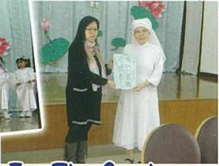
參觀聖瑪利亞安老院 Visit St. Mary's Home For The Aged