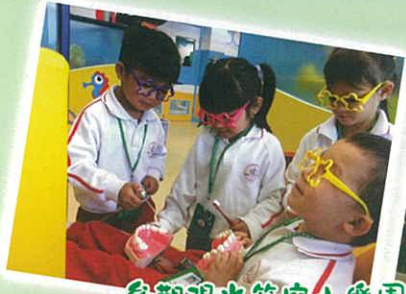
參觀陽光笑容小樂園 Visit Brighter Smiles Play land