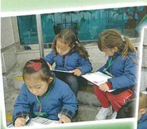
參觀金紫荊廣場 Visit Bauhinia Square