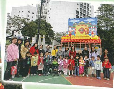
維多利亞年宵市場參觀活動 Lunar New Year Fair in Victoria Park