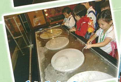
參觀香港科學館 Visit Hong Kong Science Museum