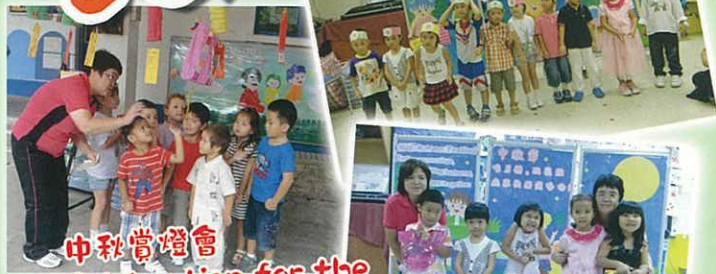
中秋賞燈會 Celebration for the Mid Autumn Festival