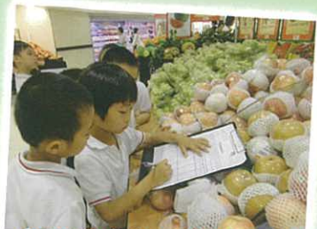
參觀惠康超級市場 Visit Wellcome Supermarket