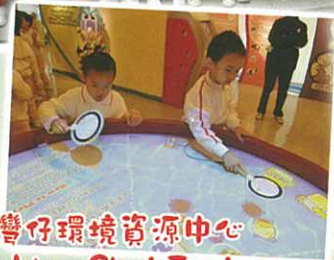
參觀灣仔環境資源中心 Visit Wan Chai Environmental Resource Center