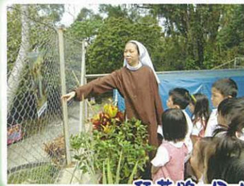
拜苦路 Religion Activity