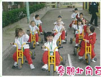
參觀北角百福道交通安全城 Visit Pak Fuk Safety Town